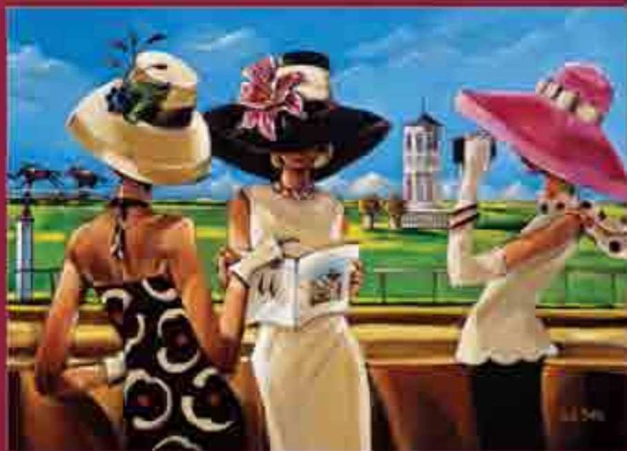
What are the Odds