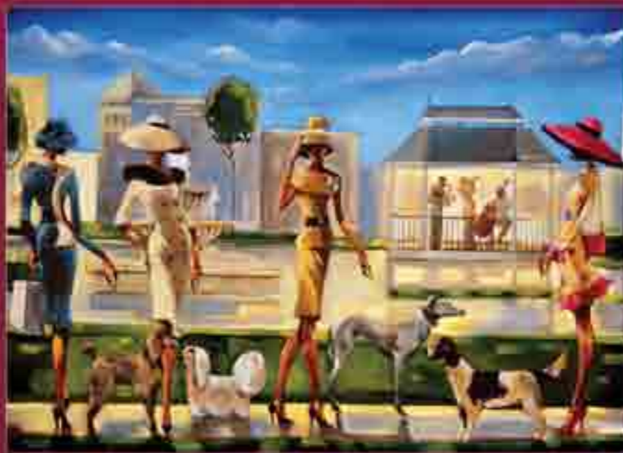
Best of Show