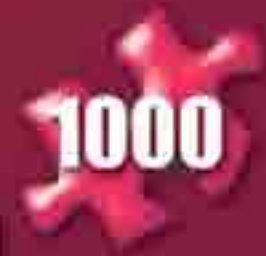
Table for Two