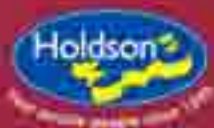
TABLE FOR TWO