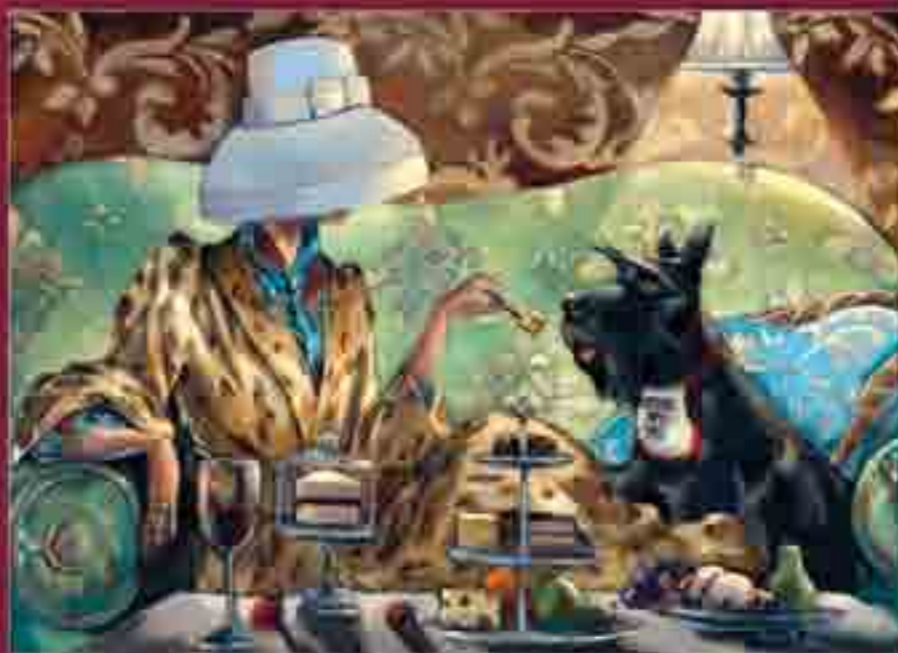
Table for Two